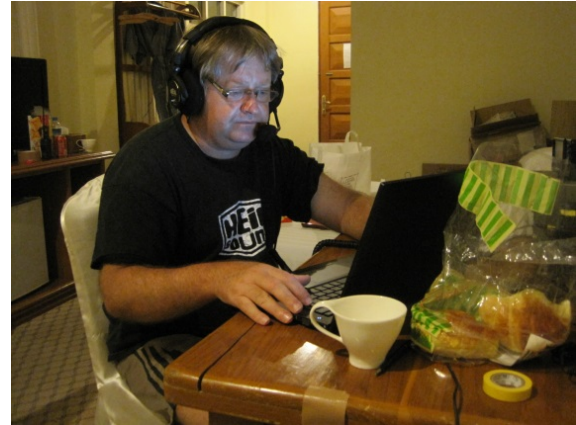
Franz-DJ9ZB and Peter-PP5XX make thousands of SSB and RTTY contacts.

We were able to work North America so effectively only because the Japanese operators were so polite and so well disciplined that they would adhere to our requests to stand-by and allow us to work the furthest regions. We had propagation to much of Asia around the clock on many of the bands.