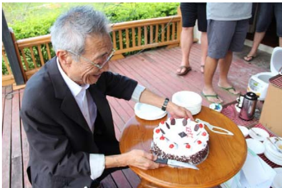
The team celebrates the culmination of their successful DXpedition with a celebratory cake.

Our operational goals were to exceed 50,000 contacts and to work the furthest regions in an effective manner to reduce the need for an XZ contact. We were thrilled that we were able to make 54,648 contacts with 17,847 unique stations over our ten day operation.