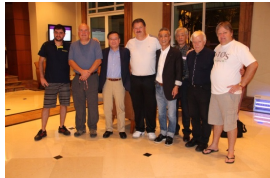
Team members PY2NDX, N6PSE, VR2KF, K3LP, JH1AJT, JAITRC, DJ9ZB and PP5XX meet for the first time in Yangon, Myanmar.