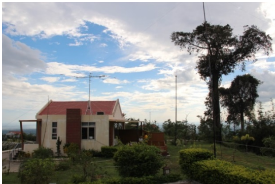
Our CW shack at the top of the hill with low band verticals in the foreground.

This worked very well and saved us a lot of time in having to set up only one directional antenna instead of three of them. We also set up vertical antennas for 12, 17, 30, 40 and 80 meters. For 160 meters, we employed the services of a rather adept tree climbing fellow to take our long wire high into an aging and very tall tree. This made a very effective support for our 160 meter antenna.