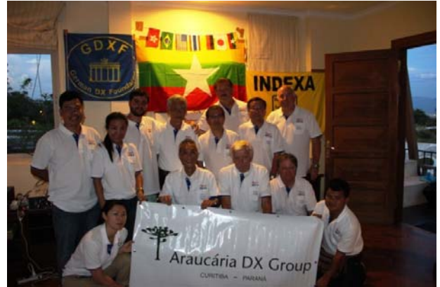
The XZ1J Team pauses for a team photo.