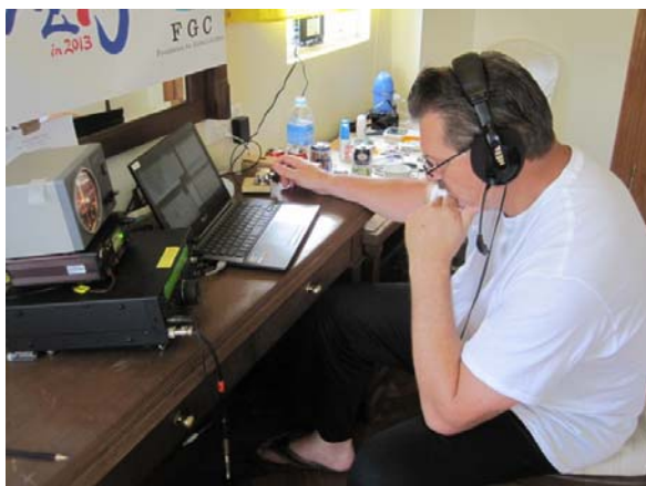
Zorro-JH1AJT and David-K3LP are QRV.

One of the highlights of any Dxpediton is to get to see and experience the unique aspects of the local culture. Myanmar is a very religious country, predominately Buddhist. We enjoyed visiting the large central outdoor market place, the main Pagoda and the sacred White Elephants in Nay Pyi Taw.