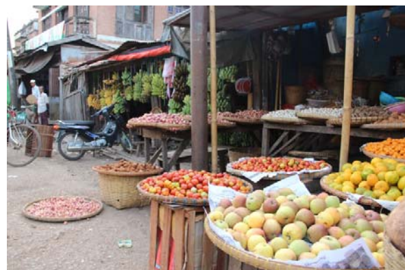
The team enjoyed a stroll through the open air market place.