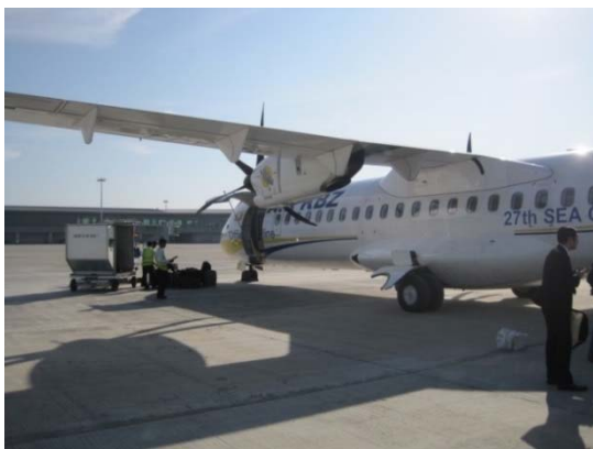
All of our equipment is carefully weighed before loading on the KBZ Air flight to Nay Pyi Taw.

The flight from Yangon to Nay Pyi Taw only takes about an hour. Nay Pyi Taw is inland, near the center of Myanmar. A few years ago, the Myanmar Government moved from Yangon to Nay Pyi Taw. The airport and much of the infrastructure is very new. They were preparing for the 27 th South East Asia Games as we visited Nay Pyi Taw.