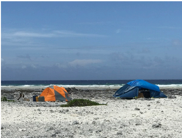
Operating and sleeping tents on Morane

The DXCC entity of French Polynesia includes about 100 islands and atolls within a large area of southern Pacific, extending approximately 2200 km in the NW-SE direction, and up to 800 km perpendicular to it. These islands are grouped in 12 IOTA references. Except for Morane (OC-297), which is a new IOTA reference, the Actaeon group (OC-113) is the rarest. There was only one operation from OC-113, carried out in April 1990 from Marutea Sud, one of its atoll counters. Ranked #6 on the Most Wanted IOTA List, this reference is in demand by 98% of IOTA members.