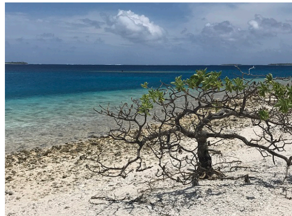
Lagoon of Morane