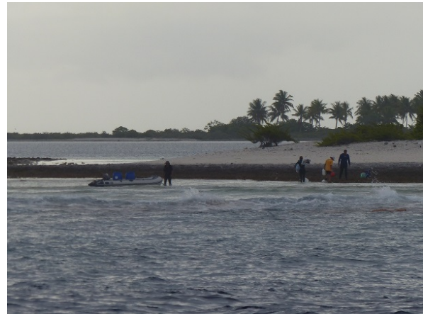
Landing on Maria Est

Safer, this option required a sustained effort from everyone, and took much longer than landing. Once on board the yacht we set sail to Maria Est right away, where we arrived after a 15-hour voyage. Landing on this atoll was done by driving the dinghy and pacing it against the ocean swell to go over the edge of the reef. The submerged and dry parts of the reef had razor-sharp edges, so everything had to be carried by hand about 200 m to the shore.