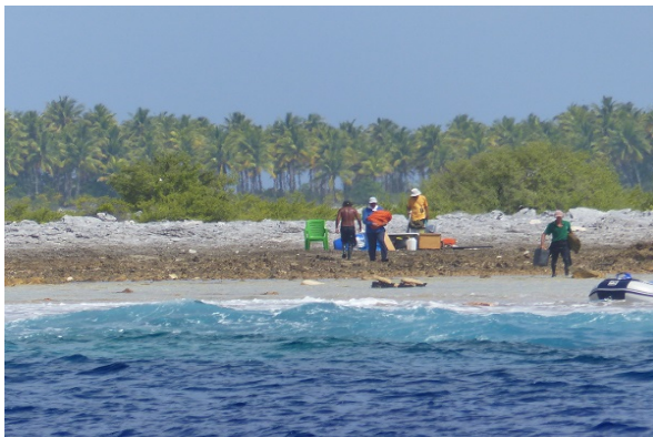
Departing Maria Est

Similar to Morane, weather and ocean conditions obliged us to depart from across the lagoon. However, since the atoll sits a little higher above the sea level, all the hardware had to be carried out by hand for close to 1 km, a much longer distance. And this included the dinghy! Exiting operations took 6 hours, extending well past the high tide window, an attenuating effort under a burning sun.