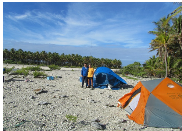
Operating site at Maria Est

Radio activity from Maria Est was between December 12 and 16. The TX0A log has 5135 QSOs with 3446 stations in 79 DXCCs on 6 continents. About 35% of the contacts were on 40 m, 18% on 30 m, 26% on 20 m, and 21% on 17 m, with almost 95% of the QSOs in CW, and the rest in SSB. The continental distribution of QSOs was AS 22%, EU 33%, NA 39%, SA 3%, OC 3%, and AF <1%, while the top five DXCCs by QSOs and number of stations were K, JA, I, DL, and UA.