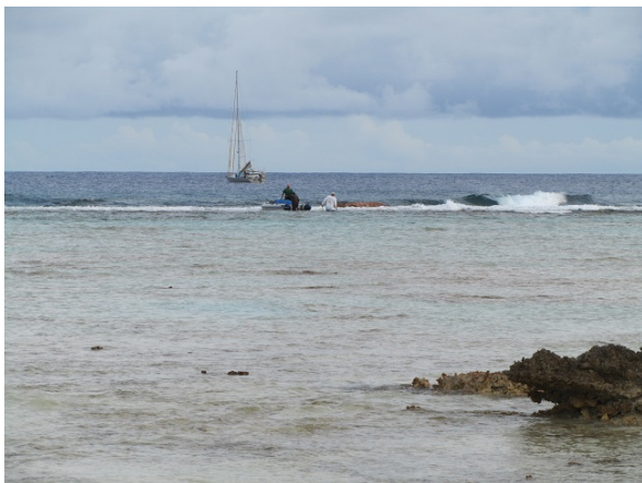
Departing Morane from the opposite site

As the wind direction changed, departing the atoll as we came in was deemed too hazardous, and the decision was made to transport everything across the lagoon, and leave the reef from its opposite side.