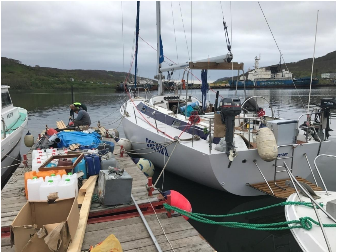
Sailing yacht "Oberon" before the departure from Petropavlovsk-Kamchatskiy