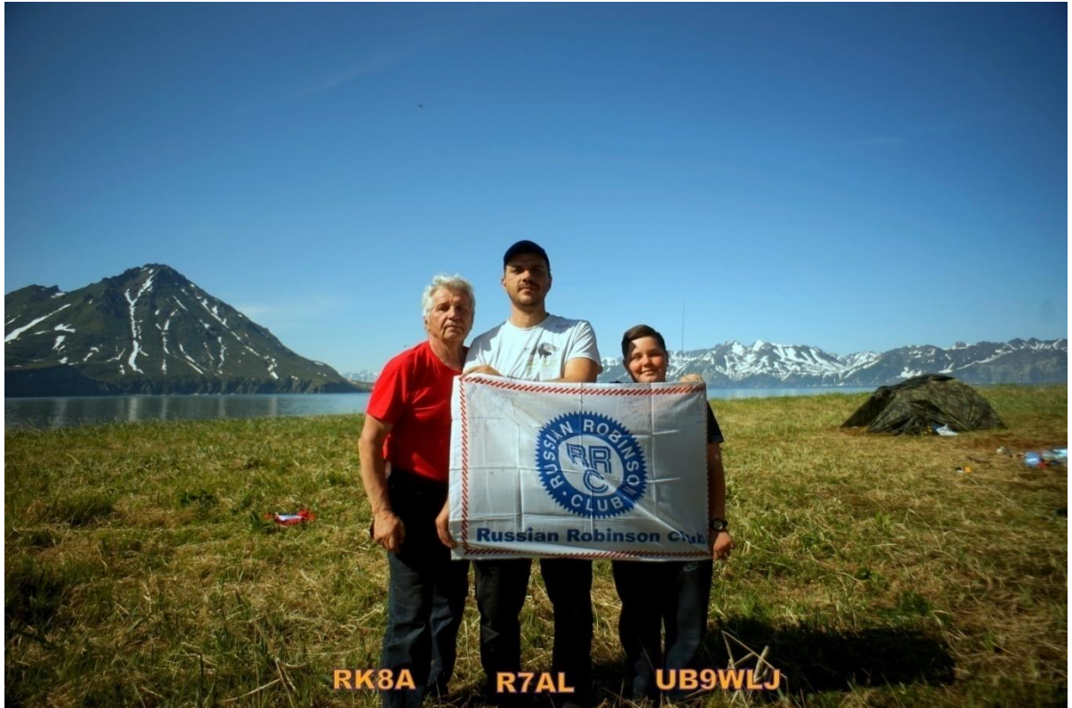
R205NEW Radio Team

Such a difficult and expensive IOTA projects are impossible without your help!! Thanks everyone for QSOs with AS-205 and see you soon on the air!!