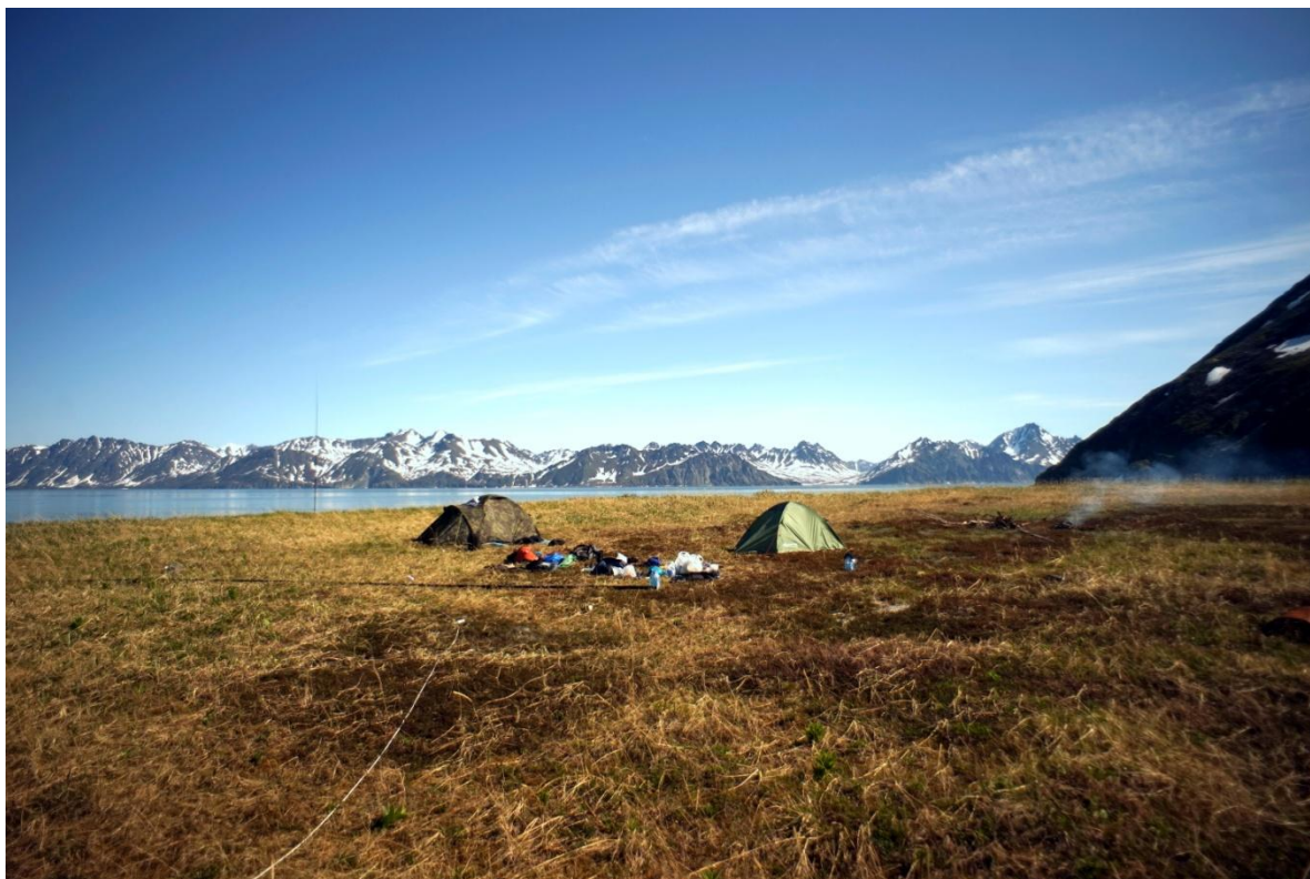
Our camp on Bogoslova island, AS-205NEW

Thanks to the help of the yacht's crew it took no more than two hours to bring all our equipment to the meadow. Guys also installed the tents while we were busy with the antennas.