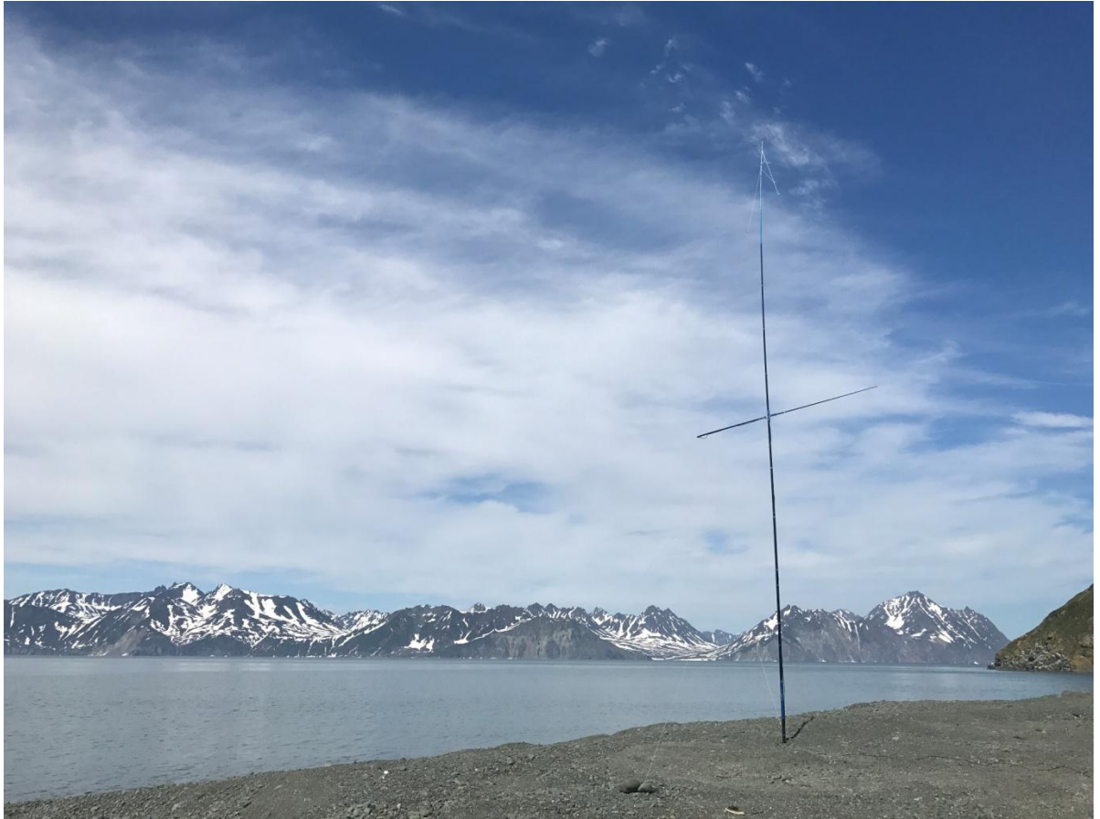
VDA on the shore and view towards NA

The next morning Vlad's health improved and he was already able to operating on the air. Everything was going very well and after the first full day we logged more than 2000 QSOs.