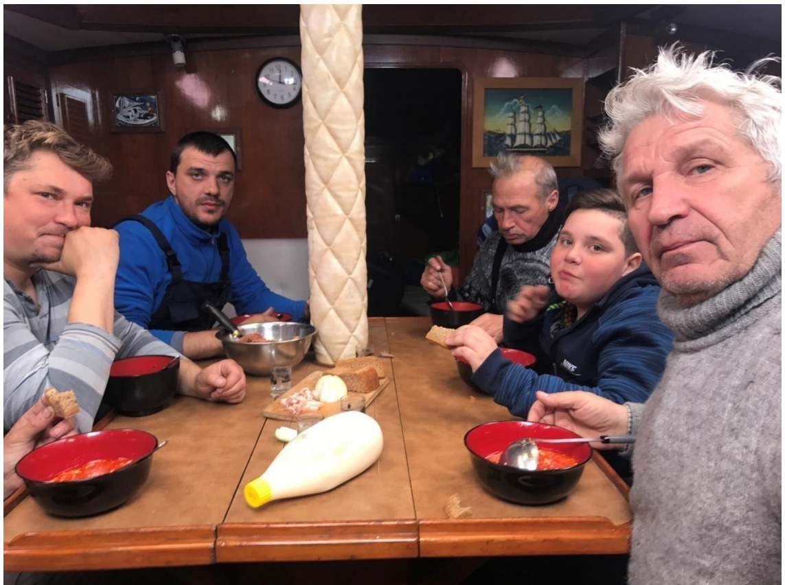
Lunch on a yacht after the storm