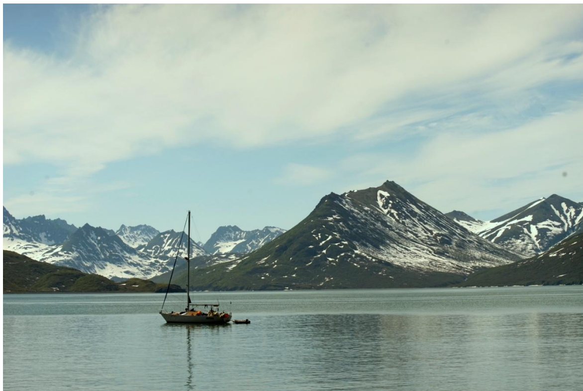
“Oberon” anchored at Natalii bay

After we went into the Natalii bay and approached the northern side of Bogoslova island, the weather changed dramatically! Icy wind and fog gave way to bright sun and calm. Looking ahead, I'll say that Natalii bay has a fantastic micro climate and all three days on the island the weather was really perfect with the daytime temperature 18+C.