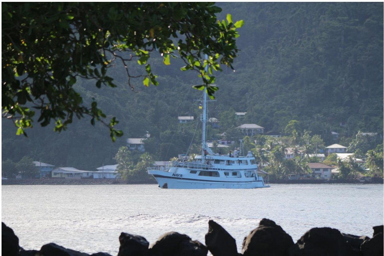
Nai’a arriving in Pago Pago to pick up team

After a month of searching, a very experienced vessel out of Fiji called the Nai’a was chosen. The Nai’a had been to this area many times on searches for Amelia Earhart and was very experienced with a crew that could safely get us on the island, help move the tons of equipment to the stations, and provide food on a daily basis.