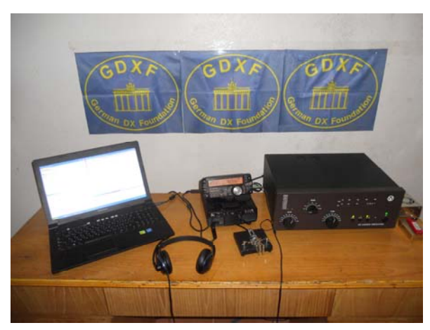
C21GC shack view

During the first 3 days I broadcasted on 40-10 meter bands for CW and SSB. On the fourth day I solely raised the antenna for 160/80 meters. Its building and adjustment took me around 4 hours. Continuous work once more without any breaks under sweltering heat. Temperature was 40° C in the shade. While I was building the 18 meters mast there was nobody outside. Even the dogs had taken cover in the shade. But what will not a radio enthusiast do in the name of his hobby?!