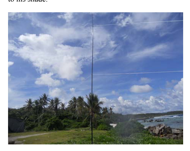
C21GC Antenna view

We quickly raised the mast and I began to fix it with braces. The heat was sweltering. Perhaps that caused the rapid diminishing of my helper's enthusiasm. After he repeatedly stated that it was too hot he headed back to his shade.