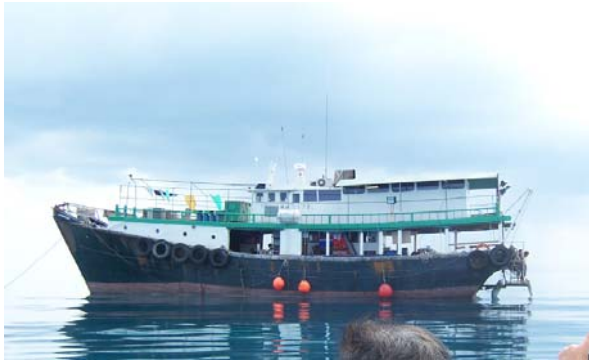
The “Deep Blue”

By the middle of March 9V1YC had traveled to Hong Kong and secured transportation, a working vessel some 75 feet in length named “Deep Blue” with all the resources the team needed. More importantly Deep Blue had traveled to Scarborough Reef many times and was familiar with the uniqueness of the area.