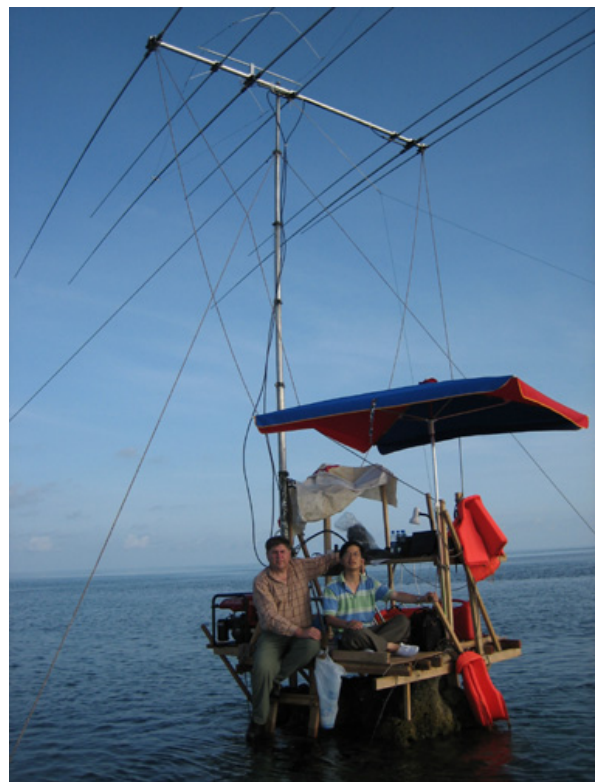
OH2BH and BA4RF at Rock 3 at high tide

April 30 th , began with BV6HJ finishing the platform for Rock #4 and several hours later DL3MBG and K4UJ, began assembling the equipment and we put that station on the air on 15M for several hours until regular shift operation to take over.