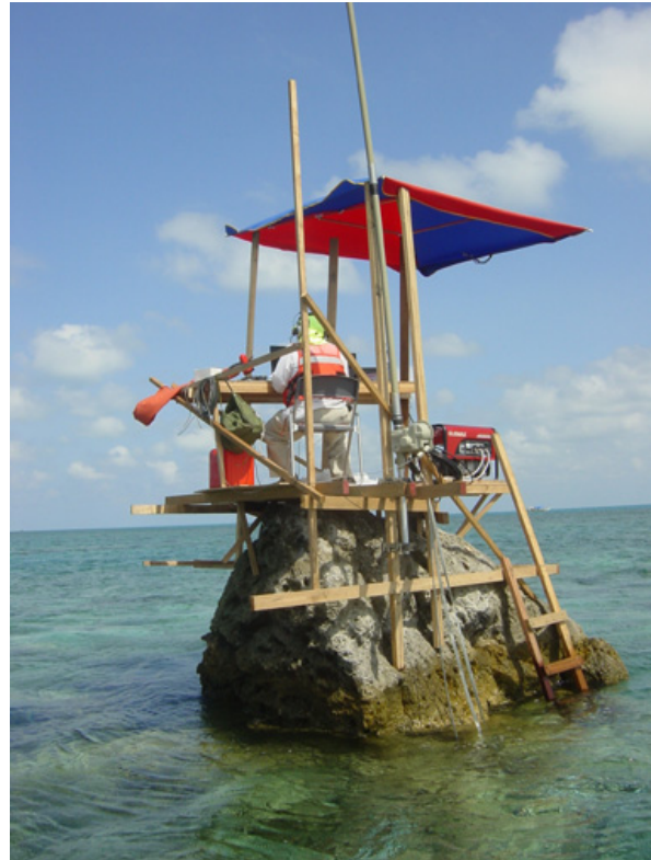
ND2T at rock1

As well this person would monitor the 2M base station in case someone needed assistance with a setting on the radio. BA1HAM took this shift many nights which allowed the other operators to get some much needed rest.