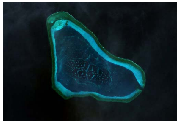
Scarborough Reef -- Lat. 15°07'N, 117°45'E