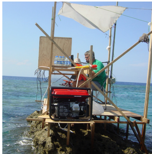
K4UJ at rock2

As with most major DXpeditions there is the question of why did you do that? Why didn't you do this? Well Scarborough Reef is no different. Did we work a lot of JA's, yep sure did, they were right in our back yard, besides who else you going to work in the middle of the afternoon when the rest of the band is dead?