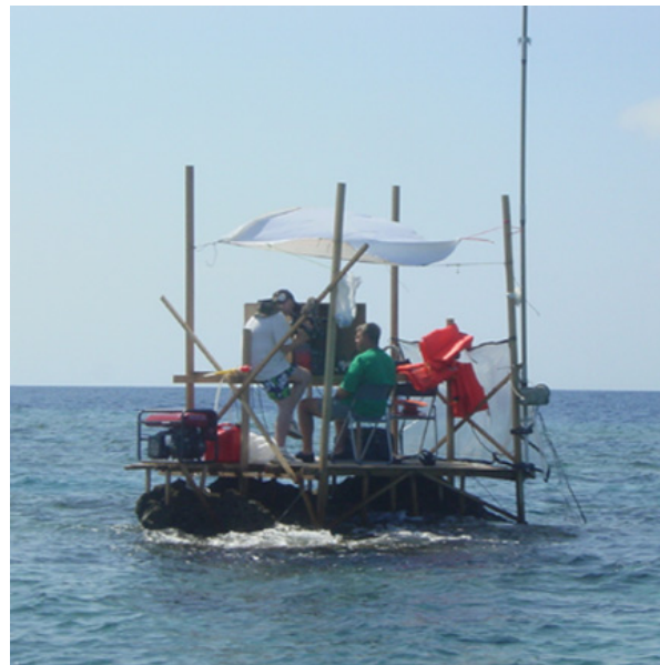
Rock 2 at high tide

equipment and two operators AA4NN and I8NHJ onto the platform at dusk and wished them luck! Struggling through darkness and a myriad of small technical hurdles they were able to get the first station on the air.