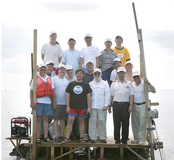
Team on a rock

For this expedition our main goal was SAFETY. Second to that was the obvious make some Q's and have some fun. This activation of Scarborough Reef was the first operation to activate RTTY, 30M, 80M, 160M, first HF Yagi and the first operation to activate 4 rocks simultaneously. Our QSO count of 45,820 almost doubled all previous operations put together.