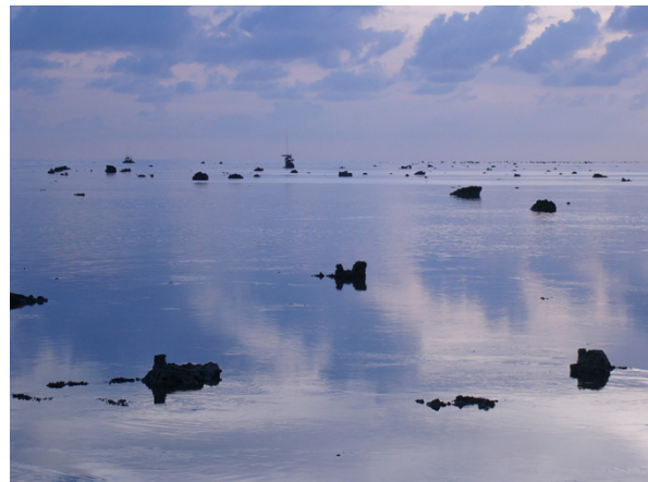
Inside the reef

Sleeping on the boat was a challenge due to the constant rocking side to side as well as fore to aft, fall too deep into sleep and you may roll out of your bunk! Then when everyone finally fell asleep we were quickly awoken to sea sick team mates in the middle of the night with dueling barf buckets sliding around the sleeping quarters (The UGLY).