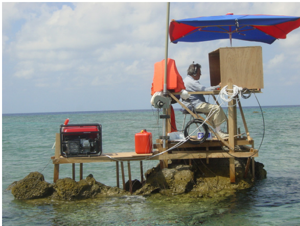
W6RG at rock 4

A word about operating shifts on the reef. Due to the time of the year, high tide and low tide changed quickly and also changed by as much as 25 minutes each day. The morning shift started about 1 hour past sunrise and lasted till shortly after lunch time (5-6 hrs), then the afternoon shift would begin and last until just before sunset, then the long shift began. The graveyard shift would be on the rock for 12-13 hours as it was unsafe due to limited visibility and low tide to change operators in the middle of the night. Needless to say, the operators that were on the night shift were really worn out when the boat arrived the next morning.