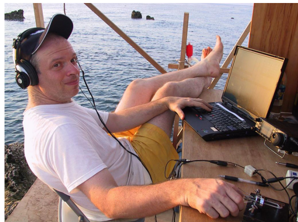
9V1YC enjoying the pile up

May 1 quickly turned into a the day of reckoning (the BAD). This day quickly reached a point where every aspect of setting up and becoming operational became a major roadblock with the limits of each operator stretched.