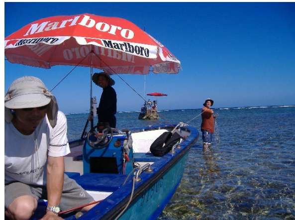
Provisioning the platform

After several minutes of attempting to communicate with the fishermen one of them jumped in the lagoon and speared an eel and offered it to us. We could only assume they were trying to barter for gasoline, a much needed resource on Scarborough Reef.