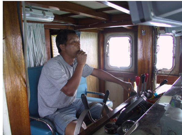
On track for the reef.

April 26 th at 0800Z we were intercepted by a Chinese fishing vessel, apparently we had charted a course right through the middle of their fishing territory, after a slight change in course we were back on track for the reef.