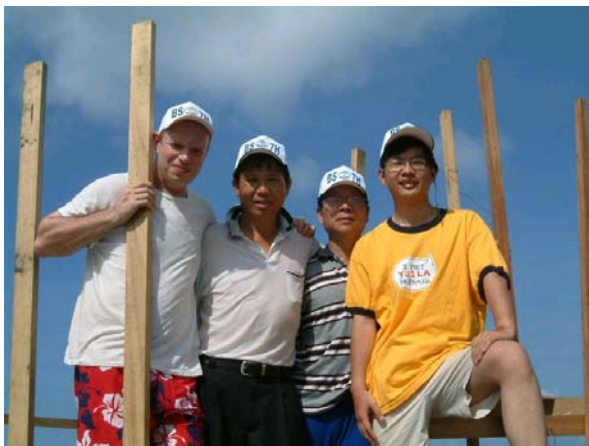
Platform building team, last rock

Upon arrival we witnessed a new way to fish, DYNAMITE! We observed a huge splash near one of the fishing boats and could only surmise that they were using an explosive device to shock the fish before scooping them up (The UGLY).