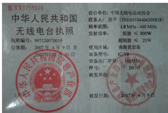
What you really need

In addition, the method of fundraising by using PayPal, and online web donations made it easy for amateur operators worldwide to contribute financial support to the operation and see their donations listed on the website in near real time.