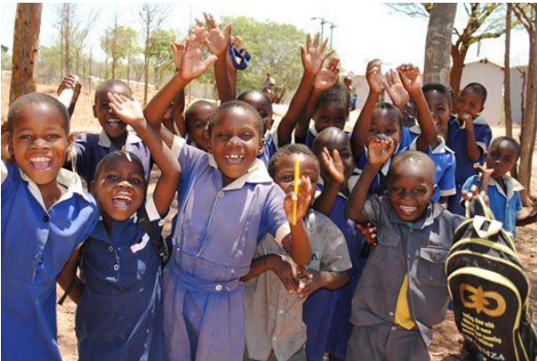
Figure 8 Sabona Norway www.sabona.no