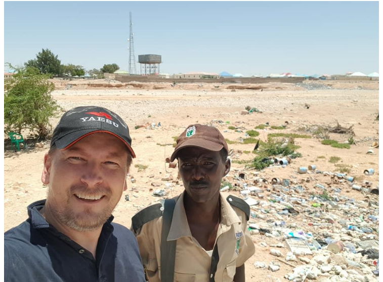
Figure 6 Armed beverage guard 24/7

As the days went along pretty much the same, I realized that propagation was not the best. The high rate bands to EU was useless. On 20/17m most days the EU stations would be very weak during daytime at the noise level or just above. In the afternoon the signals would improve, and I could have some hours of strong signals on higher bands. 20m to NA was a disaster, there was simply no reliable openings there despite I checked conditions every day. I also tried to focus on giving Asia a chance to work Somalia. However, the predicted openings to east did not occur on higher bands as predicted. The most stable band to Asia was 40m that opened very well prior to my Sunset. As we approached my sunset the target was low bands 160/80 and 40/30. The propagation on 160/80 was