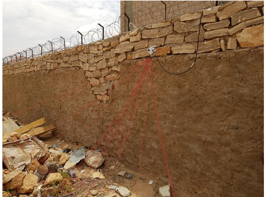
Figure 4 African style 160/80/40 m vertical

home, some cutting and tweaking of the impedance was necessary as final adjustment. This was not so easy with the top loaded antenna on the rooftop with guy wires as my assistant did not speak English nor did I speak Somali. With the additional armed security in place, the tuning process was slowed down. As we approached the sunset the first day, I realized I had to complete the tuning of verticals until next morning. I was then planning to do 20m to NA. However, when I started to call CQ I realized that the propagation was bad and not as predicted. There was absolutely no propagation on 20m, I could only work OK2PAY on 20m, but that was the only station I heard