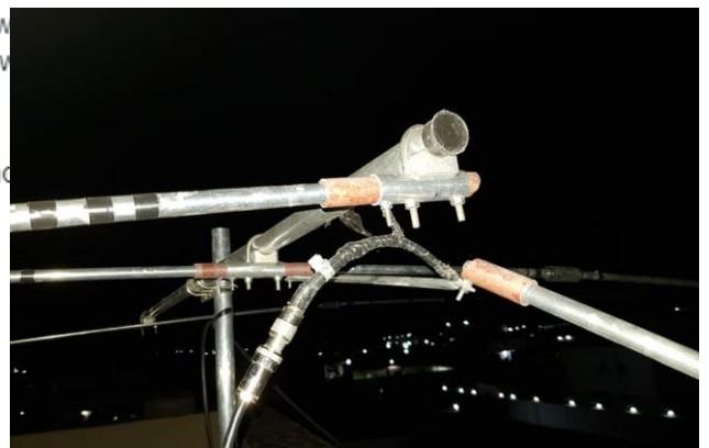
Figure 5 Mosley beam failed!