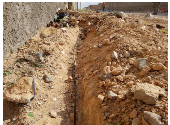
Figure 3 Trench dug by local craftsmen. 4" deep!

Arriving in Somalia I was welcomed by the local contact and we headed for the guest house with the secure transport. I was pleased to see that the trench for the RX coax was already done. I started installing the antennas, and after 4,5 hours all verticals, the beam and the beverage was up. It was very hot, and I also had some trouble tuning the 160/80/40m vertical. Although this was pre-tuned at