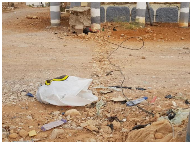
Figure 7 RX coax for Beverage crossing a public street

sometimes very good to EU. While people spend years to improve their station, a DXped have to setup their African style field day station in hours. My beverage would work well towards EU, but the weaker NA stations would be more difficult from this part of the world, especially on 160m. From my home station I know there can be a big difference in RX capability of a beverage compared to a RX array. Using a single directional beverage has its limitations but can still work very well. But you can't change the ground or installing conditions or change the propagation. In addition, the beverage was located on a very rocky ground, making it extremely difficult to put any ground stake in the ground and take advantage of the F/B ratio. The best band to NA was the 40m band. I also had a couple of LP openings to west coast (W6/W7) and put some effort into calling that area specifically. I made some very memorable Qs to NA, even though I worked the big guns and not the small stations. I especially enjoyed the openings shortly after my sunrise where the biggest challenge would be to keep the